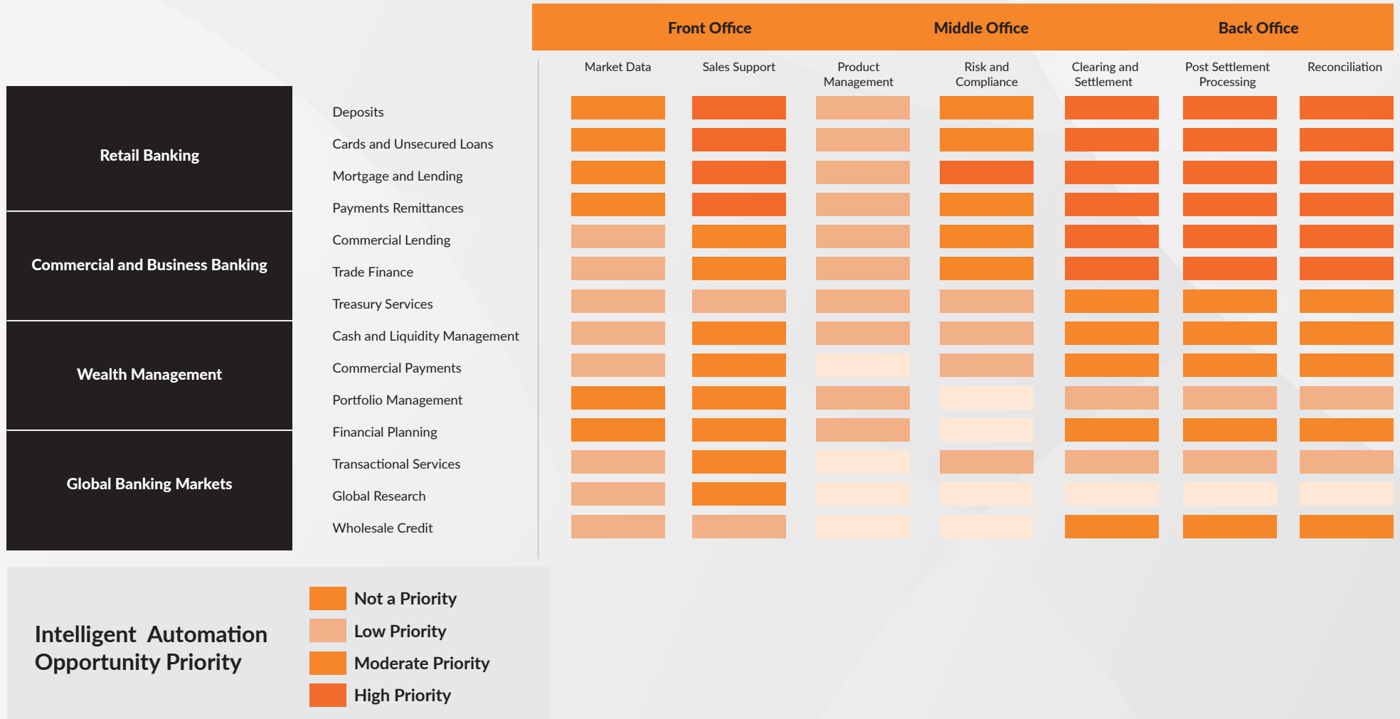
Figure 1: Sample heat map ranking priority of each digitisation opportunity. Start by identifying segments, product lines for the specific business. Next, assign a numerical priority for each.

This heat map to discover automation opportunities. Prioritise for short-term yet high-impact wins within lines of business.